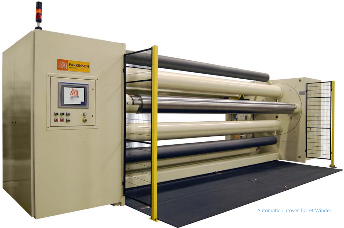
Automatic Cutover Turret Winder

Center Turret Winders offer an efficient method for producing consistent high quality rolls in small to medium sized finished roll diameters. A flat, uniform roll start prevents web damage near the core and a rapid turret index plus short cut-over cycle minimizes scrap material at the end of a roll. Precise tension control results in excellent edge profile and roll construction throughout the roll buildup. The lay-on roll can act as either a contact roll to minimize air entrapment or in a minimum gap configuration to accurately guide the web prior to winding.