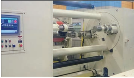
Automatic Cutover with Shaftless Turret