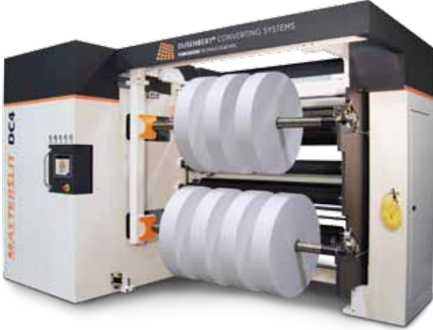
DC4 shown with optional roll pusher and laser core alignment system