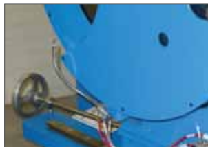
Spray Mist System