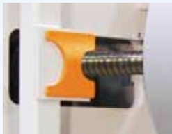
Finished Roll Pusher