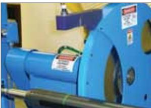
Laser Alignment Assembly