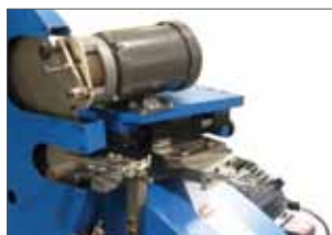
Piggyback Grinding System