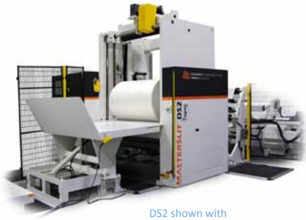
DS2 shown with roll unload table