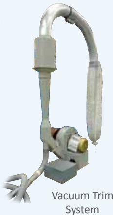
Vacuum Trim System