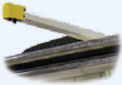
Laser Core Positioning System