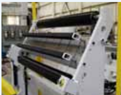
Splice Table Assembly